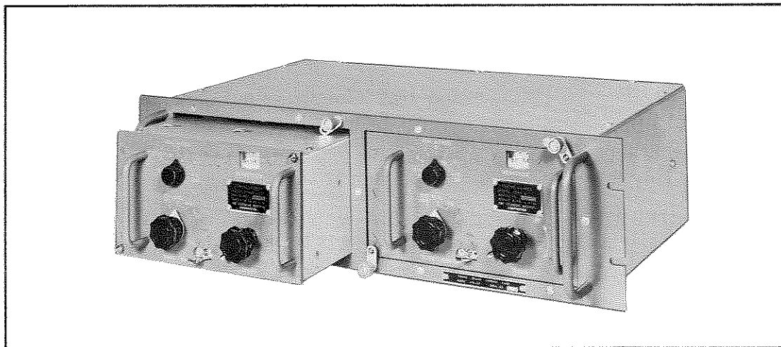
FRONT VIEW, MODEL FFR-DPH with FFRD-*