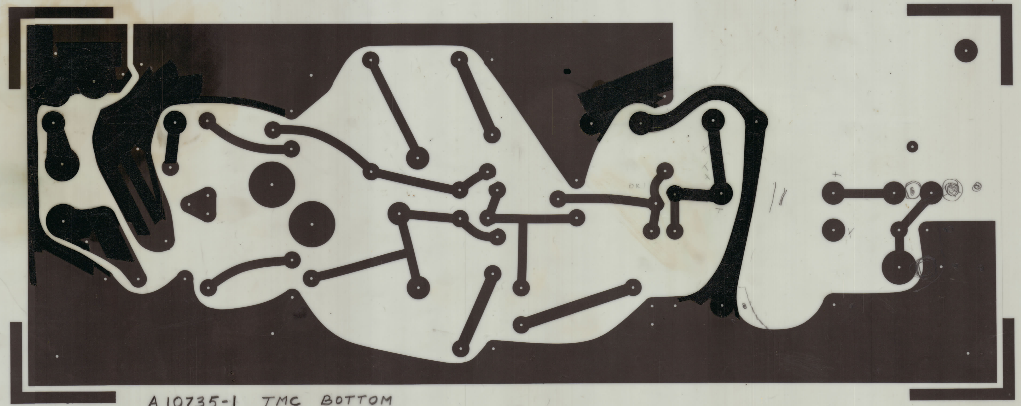
A 10735-1 TMC BOTTOM