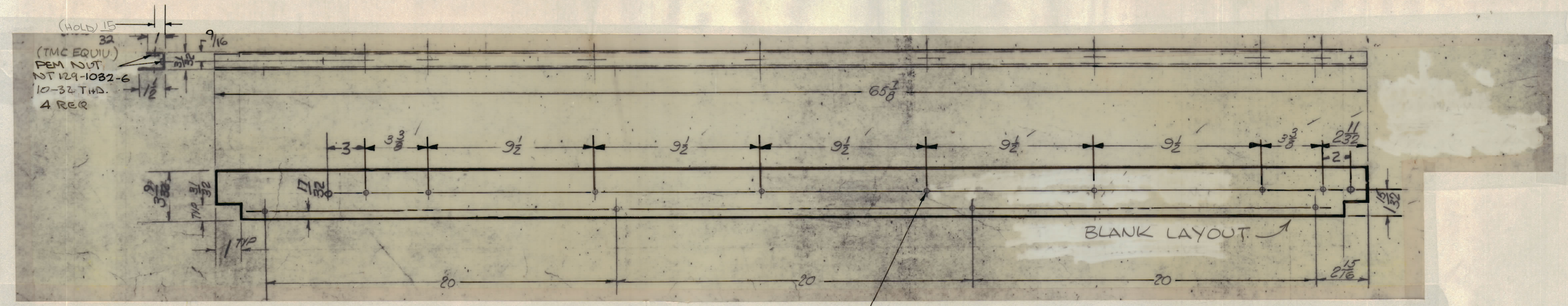
DETAIL K CHANNEL, SIDE PANEL 16 GA. STEEL

NOTE: 2 REQ. (AS SHOWN) OPPOSITE HAND FINISH UPON ASSEMBLY