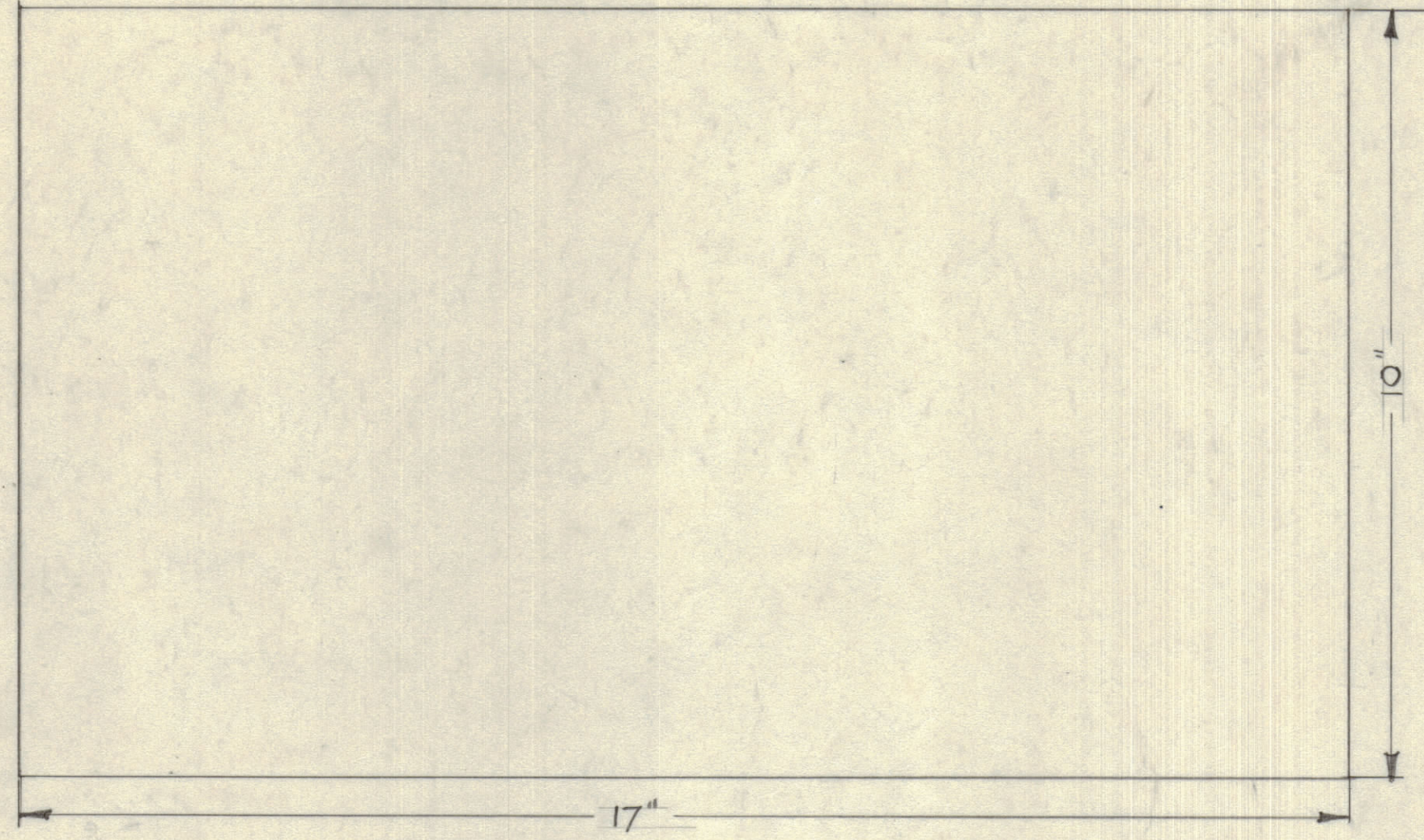
BOTTOM PLATE FOR 10" x 2 1/4" x 17" CHASSIS AMC - G

Property of: THE TECHNICAL MATERIEL CORPORATION MAMARONECK, NEW YORK